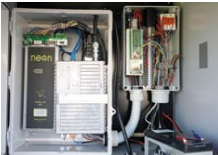
< BGAN M2M integrated with weather monitoring station

Our 3G satellite network extends the reach of your terrestrial network to more remote and hostile locations. It could also provide increased availability, or a secure back-up, in the event of power outages, natural disasters or seasonal overuse.